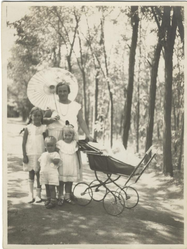
The collector's family in China.