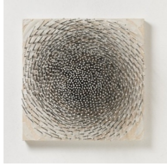
Günther Uecker (1930–2025) Spiral | 2017 | Hammered-in nails and paint on canvas, on wood | 90 x 90 x 15 cm Result: €660,000