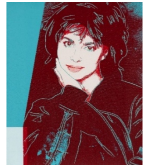
Andy Warhol (1928–1987) Untitled (portrait of Nastassja Kinski) | 1984 Acrylic on canvas | 127 x 106.5 cm Result: €435,000