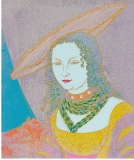
Andy Warhol (1928–1987) Portrait of a Woman (after Lucas Cranach) | 1984 Acrylic on canvas | 127 x 106.5 cm Result: €815,000