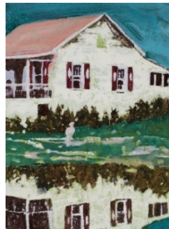
Peter Doig (b. 1959) Study For Camp Forestia II | 1996 Oil on cardboard | 68.5 x 51 cm Result: €489,000