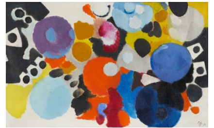
Ernst Wilhelm Nay (1902–1968) Red at the Centre | 1955 Oil on canvas | 100 x 160 cm Result: €544,000