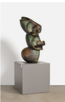
Henry Moore (1898–1986) Three Part Object | 1960 | Bronze, yellow-brown patinated | 124 x 55 x 70 cm Result: €394,000