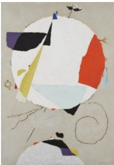
Willi Baumeister (1889–1955) Monturi, Discus (with segments) | 1954 | Mixed technique | 185 x 129 cm Result: €544,000 Highest auction result in over 25 years for this artist**