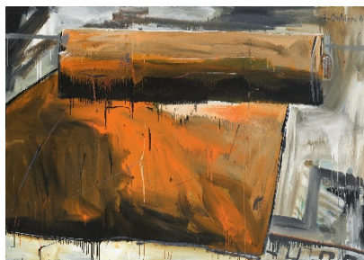
Albert Oehlen (b. 1954) Carpet | 1982 | Oil and varnish on canvas | 180 x 260 cm Result: €304,000