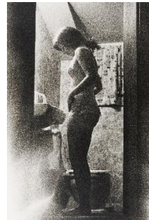
Cindy Sherman (b. 1954) Untitled Film Still # 39 | 1979 Gelatine silver print on Kapa board | 89 x 70 cm Estimate: 80,000–120,000 euros