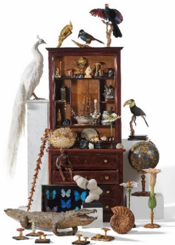
Objects from the Cabinet of Curiosities