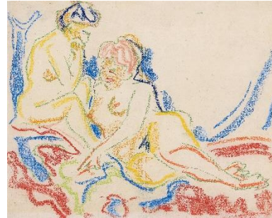
Ernst Ludwig Kirchner (1880–1938) Two Female Nudes | 1908 Pastel on hand-made paper | 34.5 x 43 cm Estimate: 60,000–80,000 euros